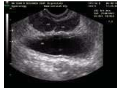
Trans-Seminal Vesicles Image

The Interson EC-7.5 MHz Ultrasound Imaging Probe is the first ultrasound probe that plugs directly into your USB port of your laptop. This versatile technology opens the door to endless applications for use in emergency or mobile situations never before possible. By simply connecting the Imaging Probe to a laptop with blue tooth or other wireless capabilities, the images can be sent anywhere in the world for the immediate benefit of the patient, the attending clinician and remotely connected physician.