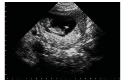
First Trimester Image

The Interson AB-3.5 MHz Ultrasound Imaging Probe is the first ultrasound probe that plugs directly into your USB port of your laptop. This versatile technology opens the door to endless applications for use in emergency or mobile situations never before possible. By simply connecting the Imaging Probe to a laptop with blue tooth or other wireless capabilities, the images can be sent anywhere in the world for the immediate benefit of the patient, the attending clinician and remotely connected physician.